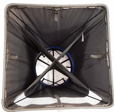
Hood with flow straightener