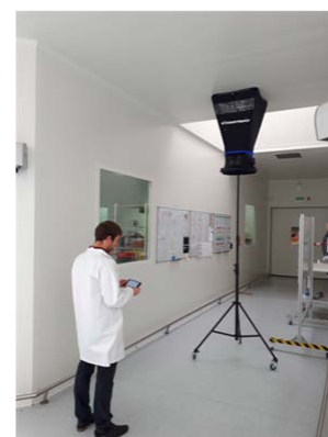
Use with the telescopic tripod