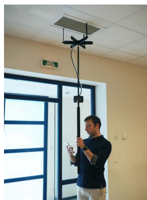
Use with the measurement grid