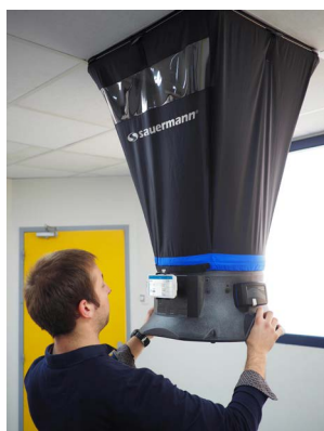
Use of the air flow meter