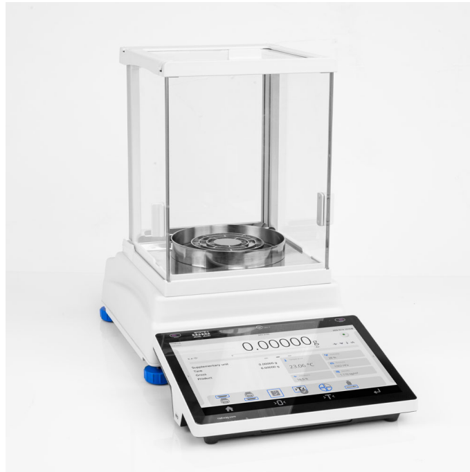
The drawings, photos and graphics used are for illustrative purposes only.